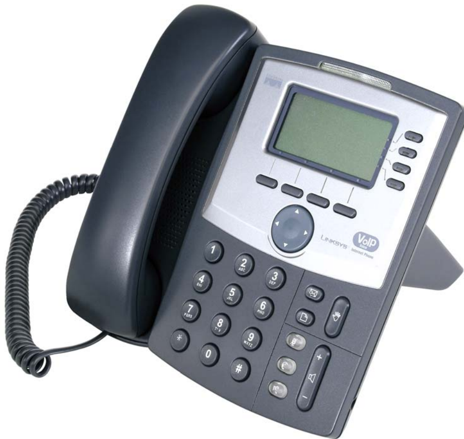
Figure 1.1: SPA941: Linksys IP Phone